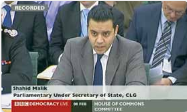
Shahid Malik Parliamentary Under Secretary of State, CLG